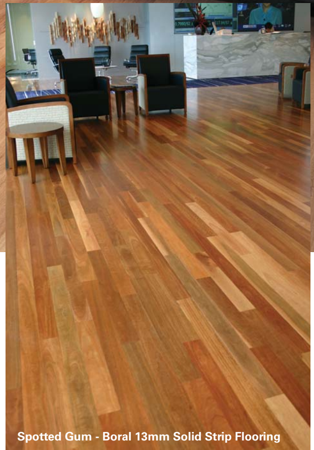
Spotted Gum - Boral 13mm Solid Strip Flooring