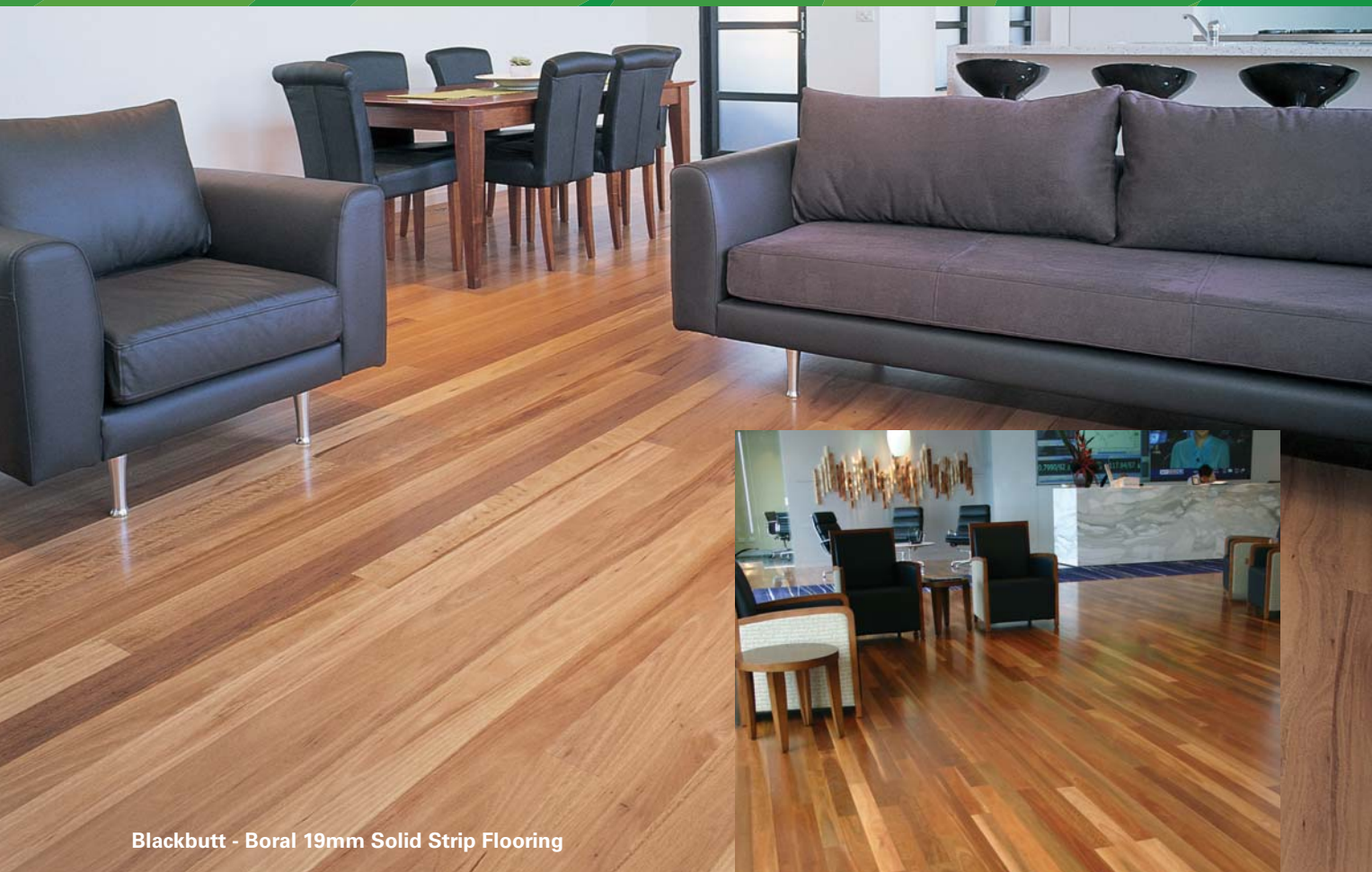
Blackbutt - Boral 19mm Solid Strip Flooring