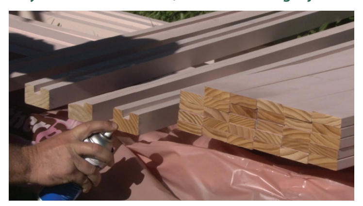
Photo 1: Avoid premature failure by applying a brush on or spray on supplementary preservative to all cut ends, holes, notches etc.

This data sheet provides information and advice aimed at improving and ensuring the in-service performance of these products such as beams, cladding, hand rails, posts, newels, mouldings, decking etc. These products may include solid timber, laminated & finger jointed timbers and LVL.