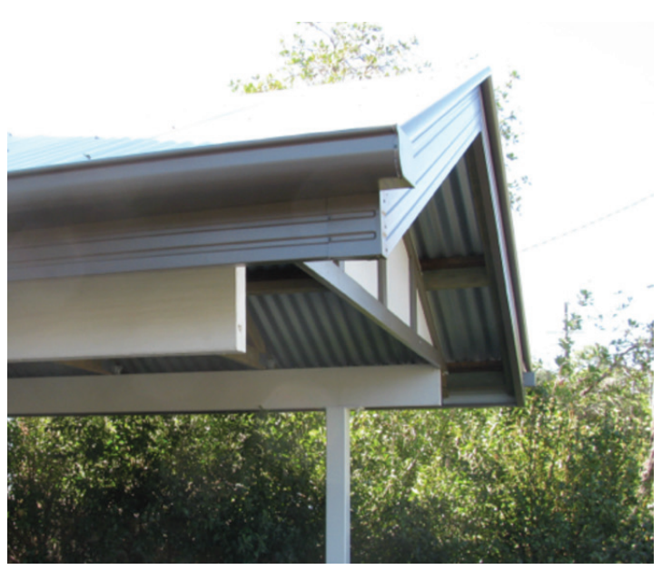
Photo 4: Adequate overhang and quality pale coloured paint system provide good protection to end grain and sun exposure.

Apply two topcoats of either quality acrylic or solvent based paint to the prepared product. In harsher environments high gloss paints are recommended.